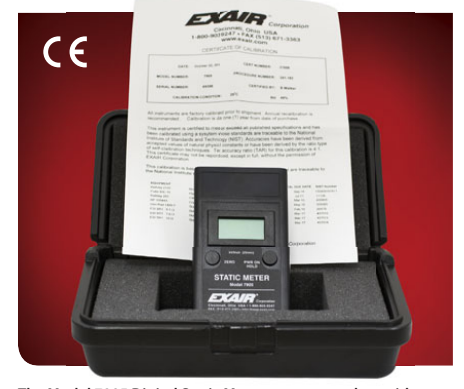
The Model 7905 Digital Static Meter comes complete with a hard-shell plastic case and a 9 volt battery. Certification of the accuracy and calibration traceable to NIST (National Institute of Standards and Technology) is also included. Calibration is available.

The Digital Static Meter features a push button "hold" for readings, a low battery indicator and an automatic "power off". A "zero" button to zero the instrument ensures an accuracy of \pm 5\% of the reading when it is one inch (25mm) from the charged surface.