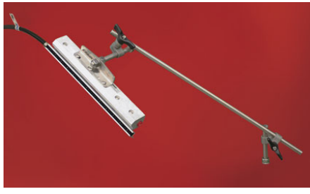
Model 9060 Universal Air Knife Mounting System provides secure, precise positioning for the Gen4 Super Ion Air Knife. See page 27 for details.

Shims: Thicker shims can be installed easily if additional hard-hitting velocity is required. For more information, see "shim sets" on page 23.